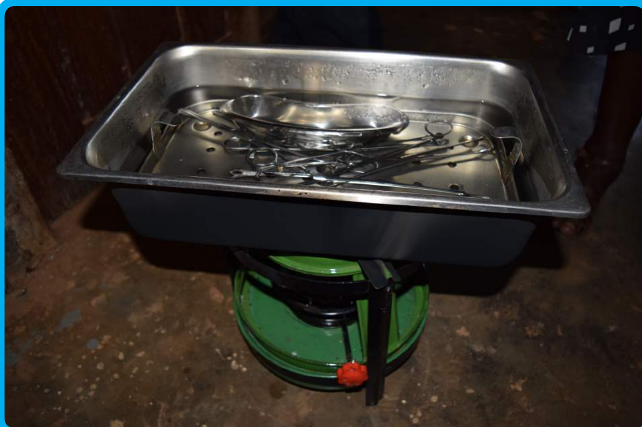
A dysfunctional sterilizer at Seeta Namugaga Health Center III in Mukono District. The health workers currently use a stove.