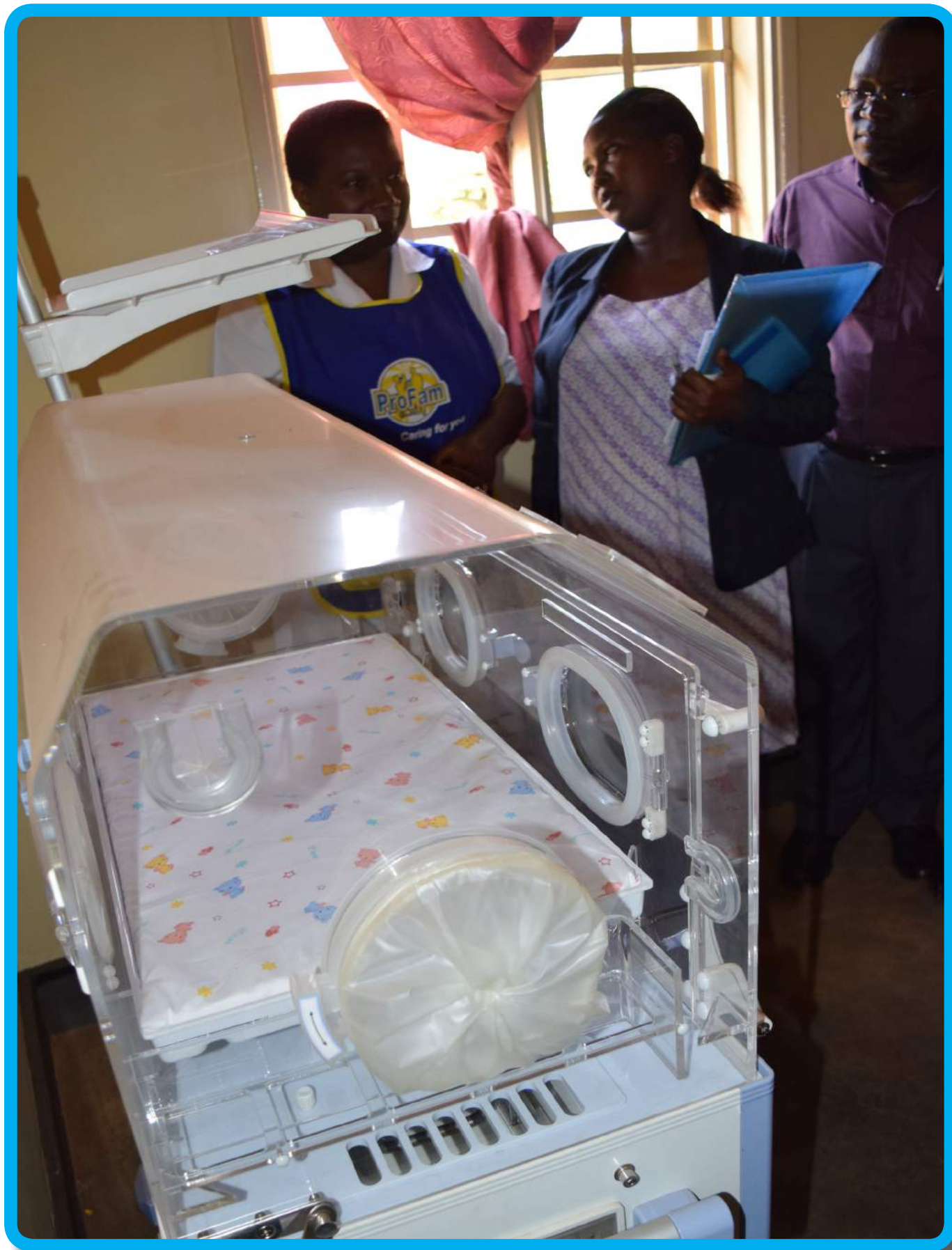
An incubator at Mukono Health Center IV