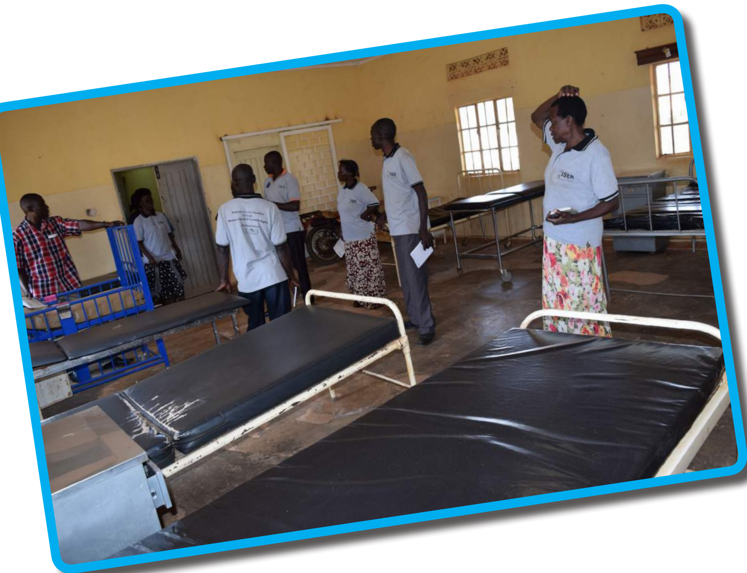
A motor cycle parked in a ward at Ntenjeru Kojja HC IV in Mukono District. It is met to do routine outreach services like immunization but this depends on the availability of funds. The ward also seems to have taken a while without admissions.