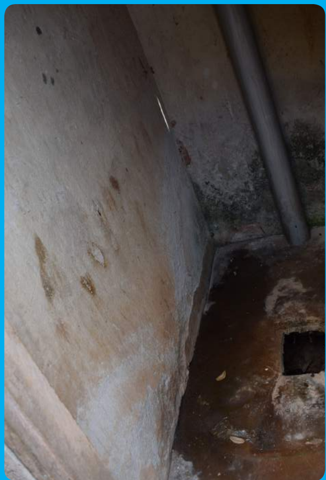
Community Health Advocates inspecting the latrine at Ntejeru Kojja Health Centre IV in Mukono District. The latrine is full and very unhygienic. This is very dangerous to the patients and community at large.