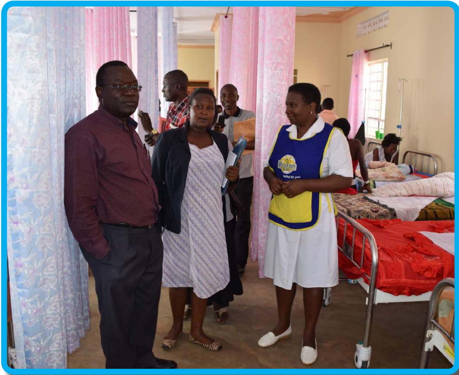
The maternity ward at Mukono health centre IV provides adequate health services compared to its peer health facilities.