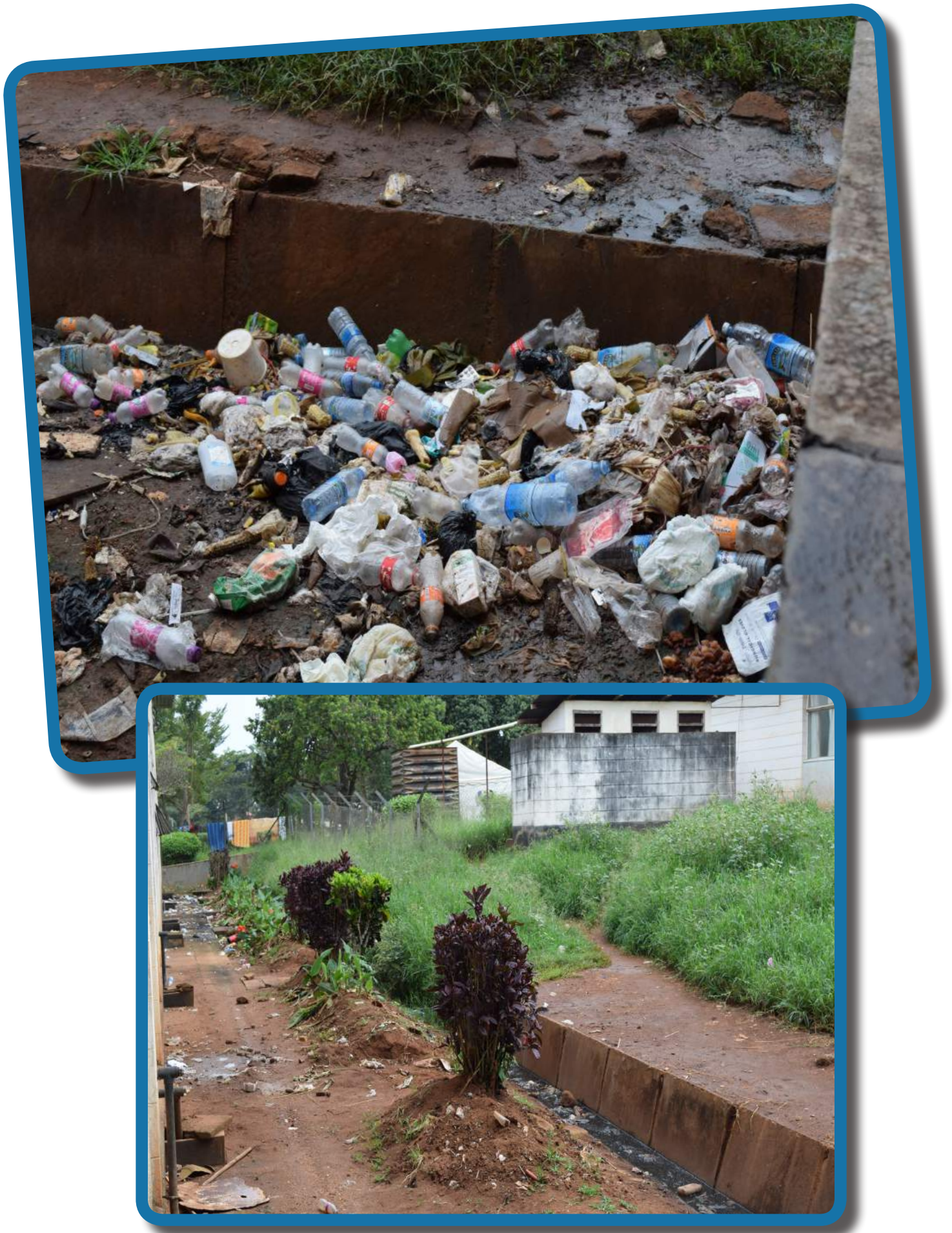
Photos showing the state of sanitation and hygiene at Kayunga General Hospital.