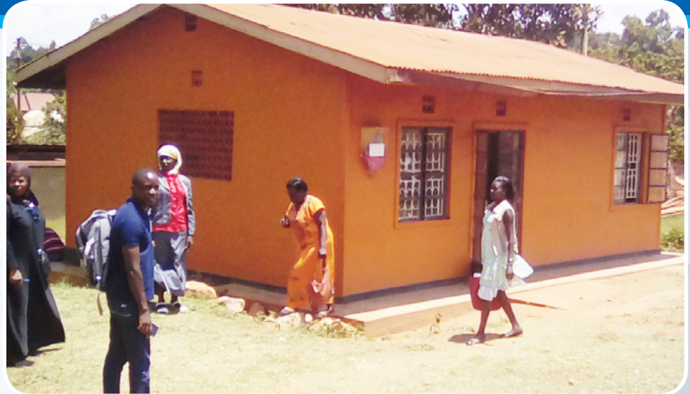
Kasenge Health Centre II.