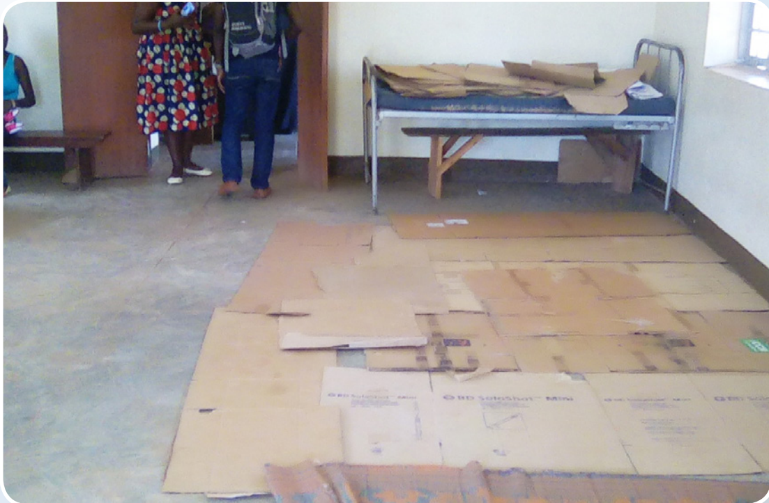
Cardboard and a mat laid out on the floor for patients to sleep on in one of the Health Centers visited.