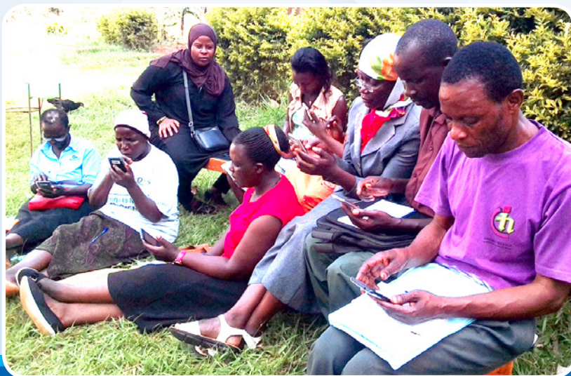
The Community Advocates navigating through the mobile data collection app.