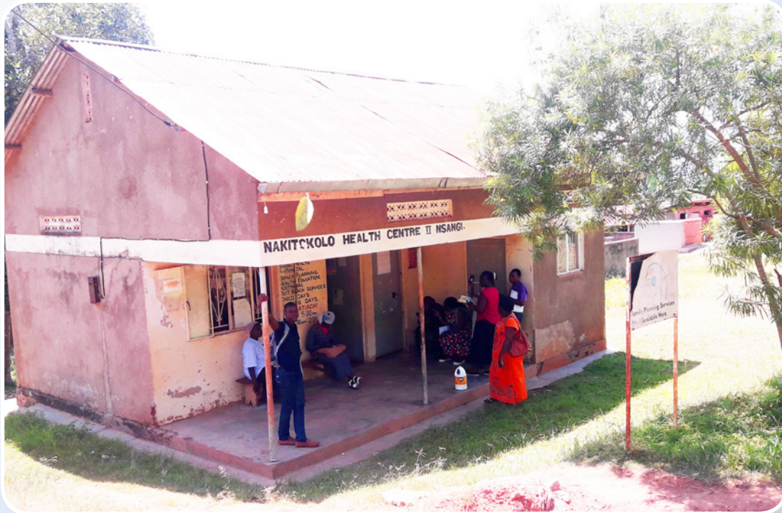
Community Advocates together with ISER staff at Nakitokolo Health Centre II in Nsangi Sub County during a joint monitoring visit.