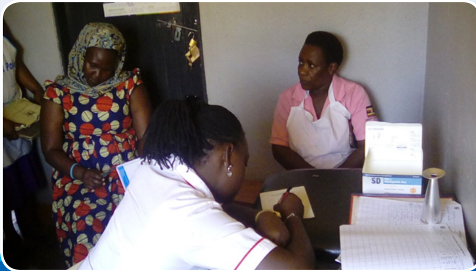
An interaction with medical workers at Kasenge Health Centre II in Kyengera Town Council.