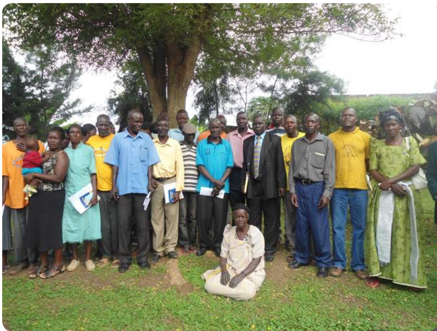
Community engagement meeting in Pallisa district on score card to monitor health services