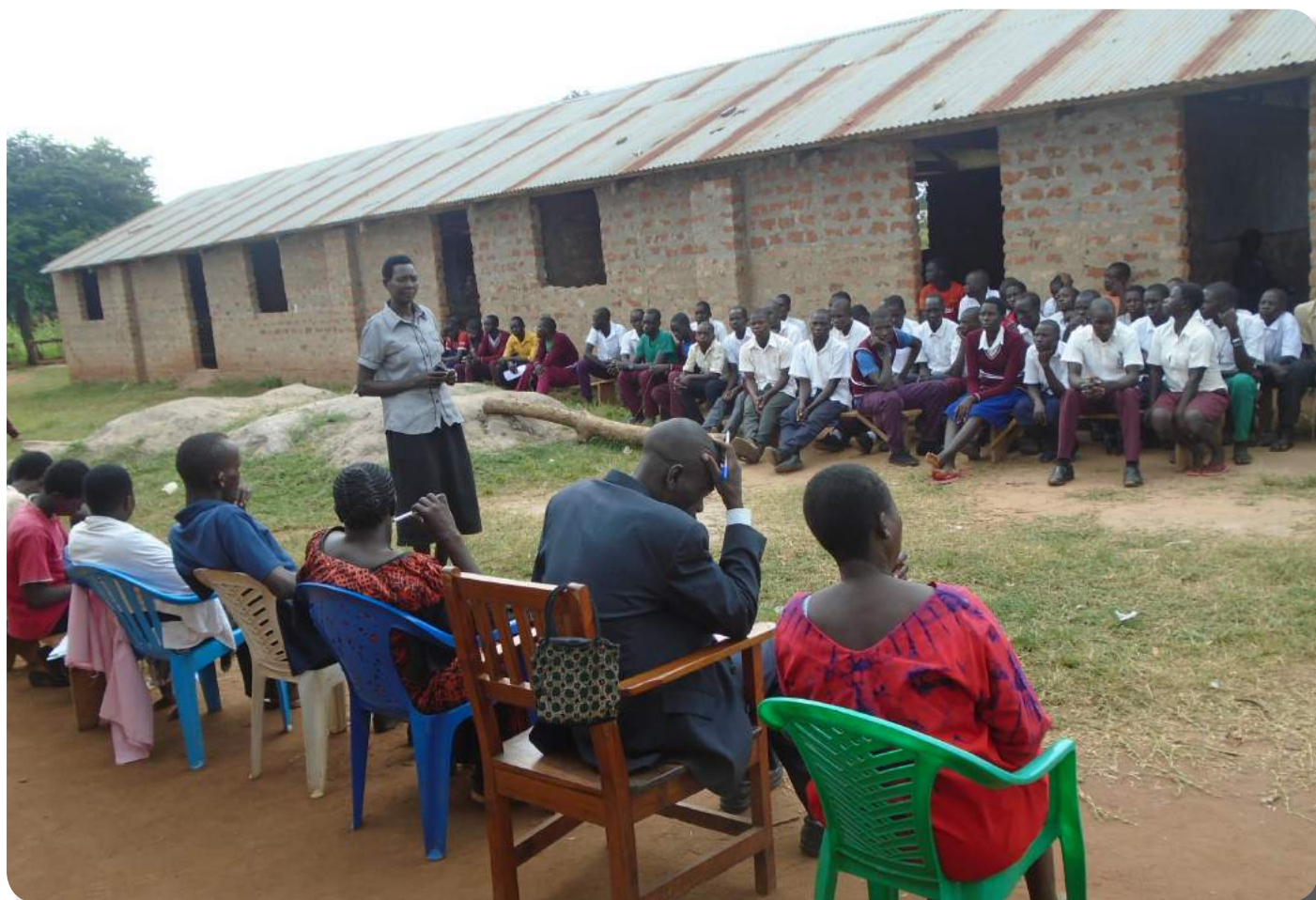
Lira sub county youth parliament in session at Albeko technical school

To strengthen education for the girl child, youth parliaments have actively engaged in monitoring and documenting relevant indicators such as the enrolment rate of girls at local schools, the pace and rates of progression through the education system, and any challenges affecting primary schools within these communities, which they report to the appropriate authorities. The youth parliament members were challenged to identify one primary school in their community, to conduct research on a pertinent issue confronting the school and to work with leaders on developing appropriate remedial action to address the identified challenge. The youth parliament in Barr identified Abunga Primary School. In Abunga primary school, the youth noted a high dropout rate of girls, including those already in primary seven. When they visited the school in June 2016, they found 16 girls in primary seven who had registered for UNEB. In September 2016, they went back to monitor the performance of the school and learned through interactions with pupils, teachers and the school administration that 6 primary school girls had left the school during this period. The youth, together with the school authorities, tracked down the girls and 3 (50%) resumed school and ultimately sat their exams.