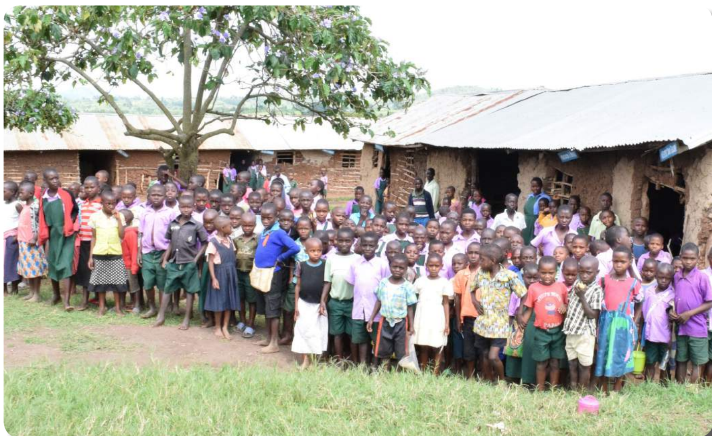
Pupils of Nyamabale primary school in Kyenjojo district at a school assembly

Another worrying factor is that some SMC members put themselves forward for nomination with the expectation of financial remuneration for their service; and when this expectation is not realized, they resort to abandoning their mandate or harassing school heads for allowances.