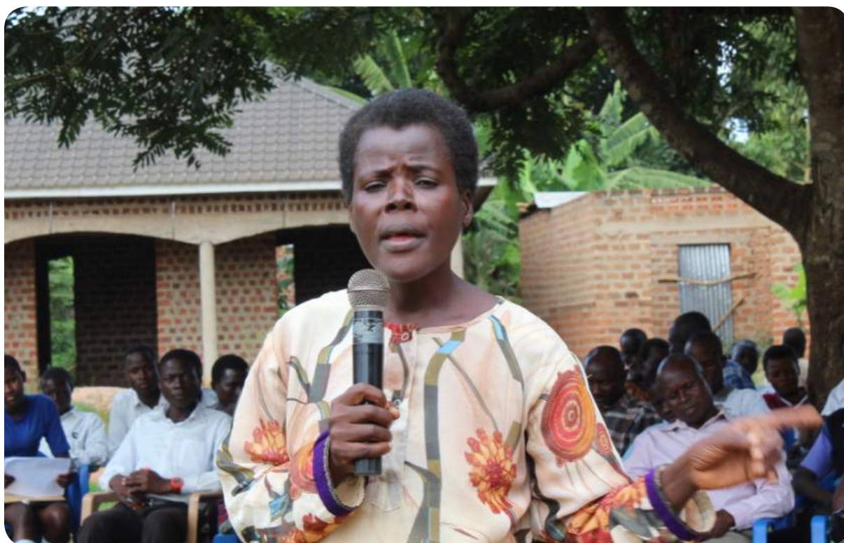
A woman raising a health issue in Kitimbwa sub county at a health Baraza held in November 2016

Secondly, the sustainability of Barazas requires both the district and community to take ownership of the mechanism. ISER hopes that these Barazas persist irrespective of whether or not ISER continues to work in