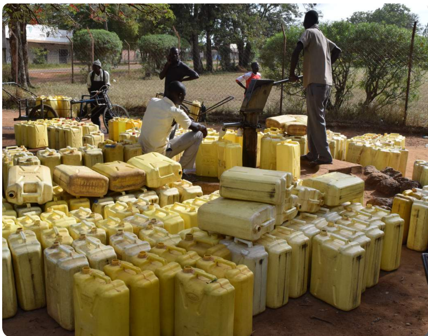
This borehole in Kumi municipal council is the main source of water for the residents. There is no running water and many other bore holes have low water yield capacity

Some WUCs are not trained on their roles and responsibilities, notwithstanding the fact that WUC members are supposed to receive regular training on how to manage water sources. However, it has been noted that some training is only conducted when new sources are being installed, with the result that successive members miss out on trainings since these committee members have a two-year term limit. For example, Tindiyan borehole WUC in Kayonza sub county was not aware about its role of maintaining proper sanitation especially related to clean and safe water management by ensuring that users collect water using clean jerry cans. This also contributed to a cholera outbreak in the village.