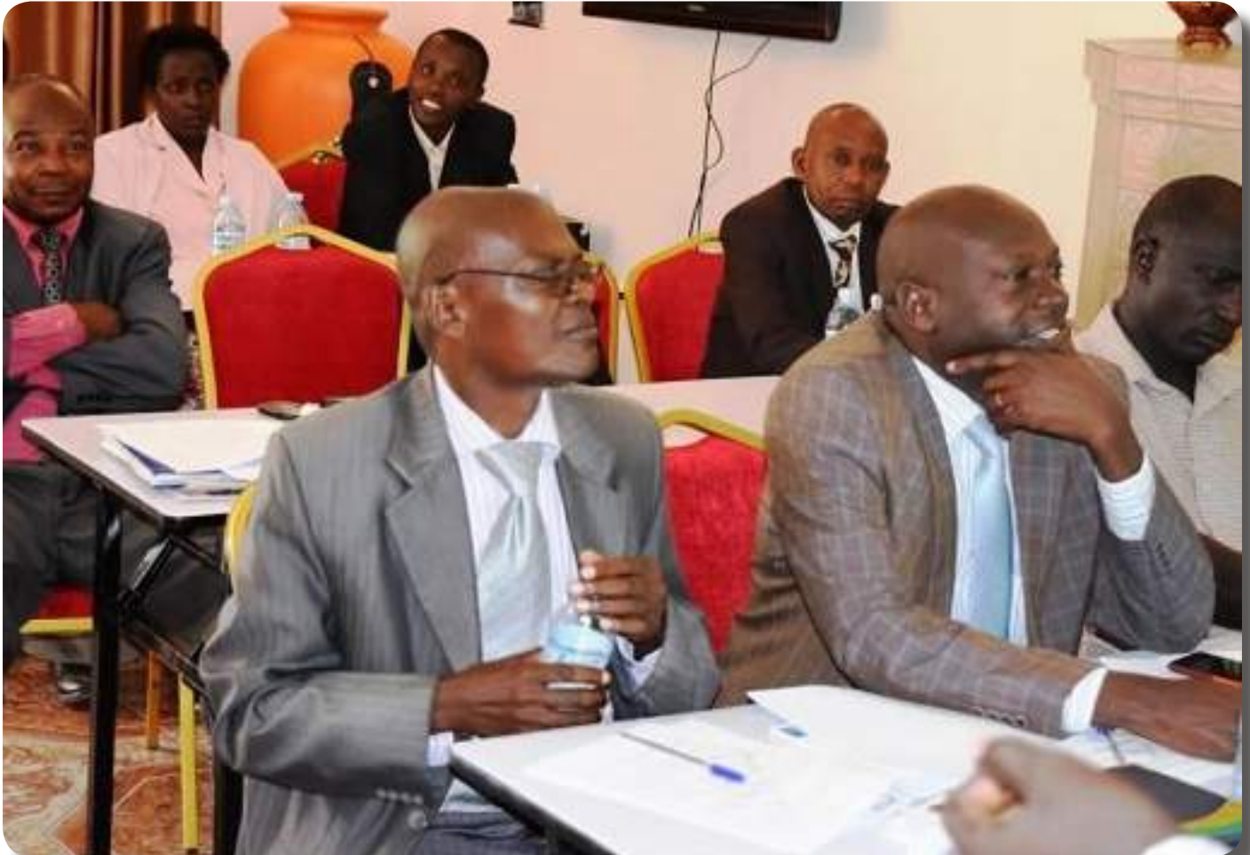
Bushenyi District officials participate in the ISER social accountability research validation workshop in June 2016

of awareness has serious implications: firstly, citizens are not empowered to demand accountability, with the result that only a handful of the citizens participate in local government planning processes; secondly, this fosters an environment in which leaders can easily become complacent, making little effort to provide citizens with any kind of feedback or general accounting for decisions and actions taken; thirdly, it presumes the discretion of political leadership – as opposed to imposing a duty upon them – to intentionally consult, engage and involve poor and marginalized citizens in service delivery processes. This situation is exacerbated by a lack of structured and legally embedded tracking and monitoring mechanisms to regulate and ensure accountability for public service delivery.