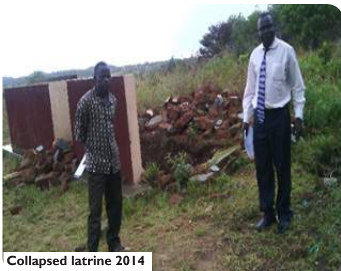
Collapsed latrine 2014