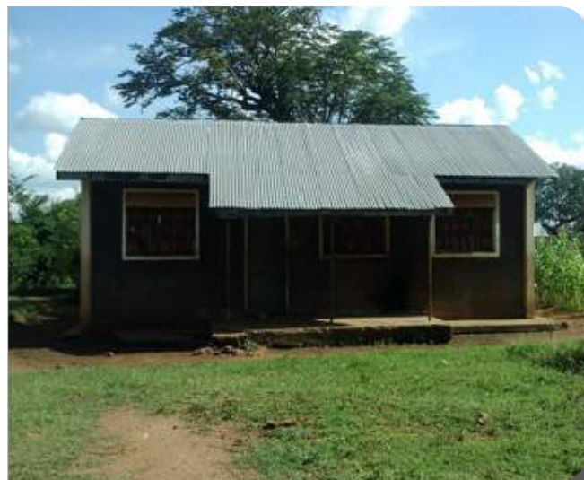
Before and after pictures of accommodation constructed for health workers as a result of social accountability work in Budaka District