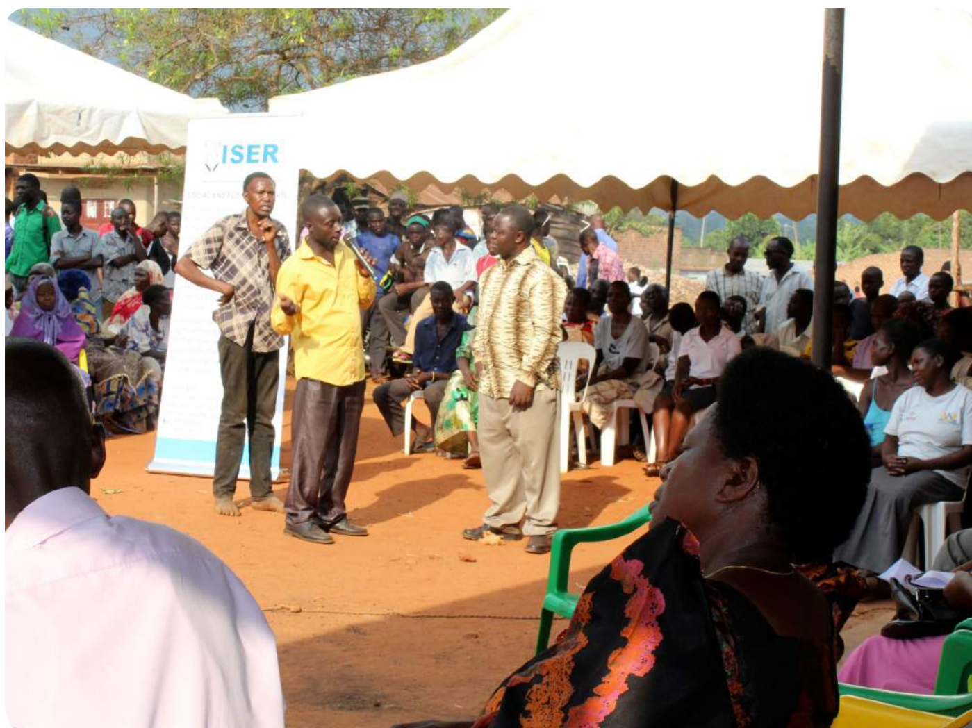
Some of the participants interact with duty bearers at the ISER health Baraza held in September 2016 in Kangulumira sub county

While some issues require ISER to conduct policy analysis to ensure that the feedback received from officials is truly in line with the policies that govern the right to health, others require follow up with the Ministry of Health, and others also require an advocacy effort through mechanisms such as the Universal Periodic Review.