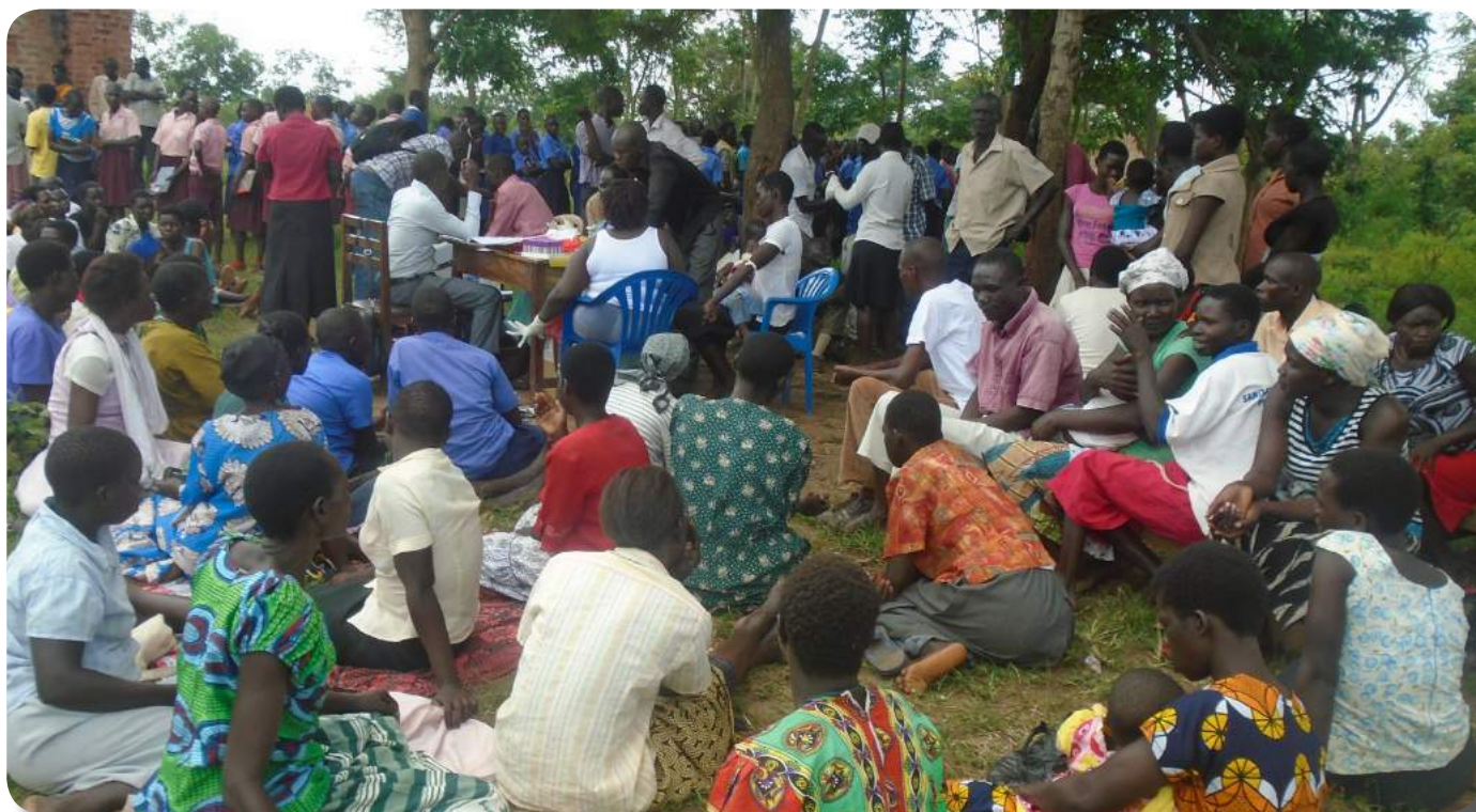
Community health camp at Ongica parish-Lira sub county mobilized by the youth parliament and facilitated by Barapwo health centre staff

As a result the youth parliaments have expanded opportunities for youth and communities to access health services through community health camps and mobilization for health services at HCs. The relationship with HC staff have been strengthened and the youth are now working alongside HC staff to conduct health outreaches.