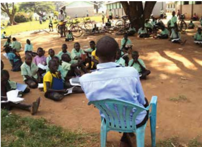
A teacher supervises pupils doing a test under a tree at Awir Primary School in Apac District. The school has over 1,500 pupils but with limited classrooms and picture of Olelpek P.S no staffroom

Although the Ugandan government and other organizations involved in the education sector have put in place many interventions aimed at improving access and the quality of education, inadequate measures exist to address the professionalism plight of teachers. Therefore, a comprehensive teacher policy with pragmatic political support is required. This process has been initiated and a drafting team constituted by the Permanent Secretary (PS), MoES.