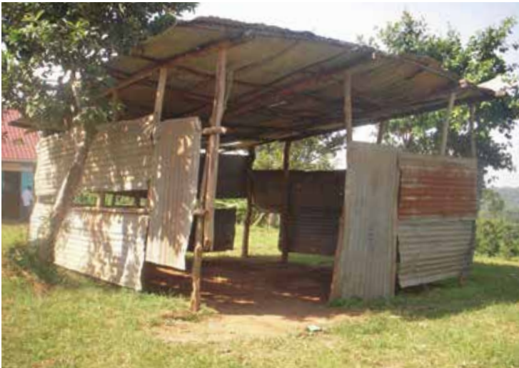
A shack constructed of tin sheets and tree branches serves as a staff room at Nakagere UMEA Primary School in Mukono District.