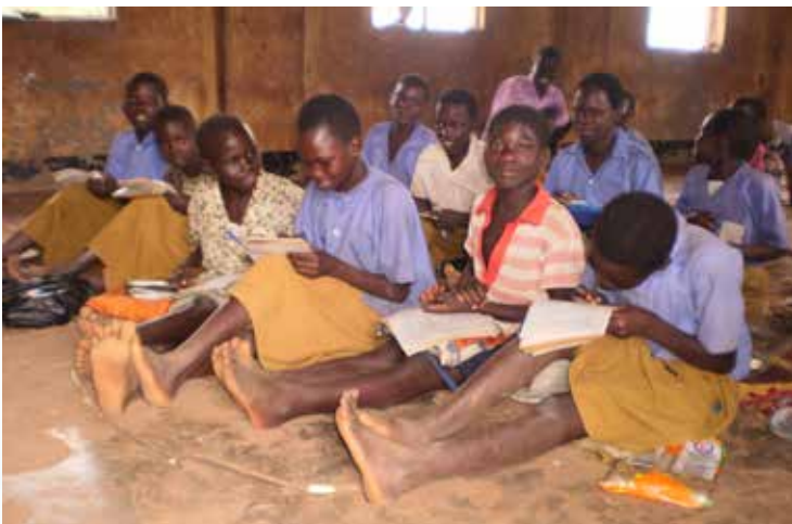
Pupils of Alwal Primary School in Apac District sit on the floor due to acute shortage of furniture

Basanyu says the increasing school dropout rate – especially among girls – can also indirectly be linked to the poor