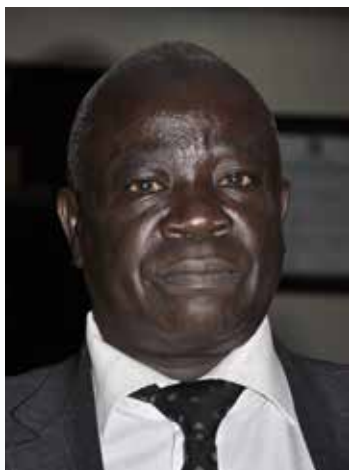
Hon. Gudoi Yahaya

Below are the MPs' opinions and insights: