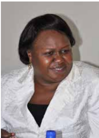
Hon. Sarah Lanyero

Hon. Sarah Lanyero, the Education Committee chairperson and Lamwo woman MP points out that the issue of teachers' remuneration must be treated as a top government priority. "Basically, the issue of remuneration must be addressed as a top priority to ensure that teachers remain motivated. The teachers are paid too little and often not on time," she says.