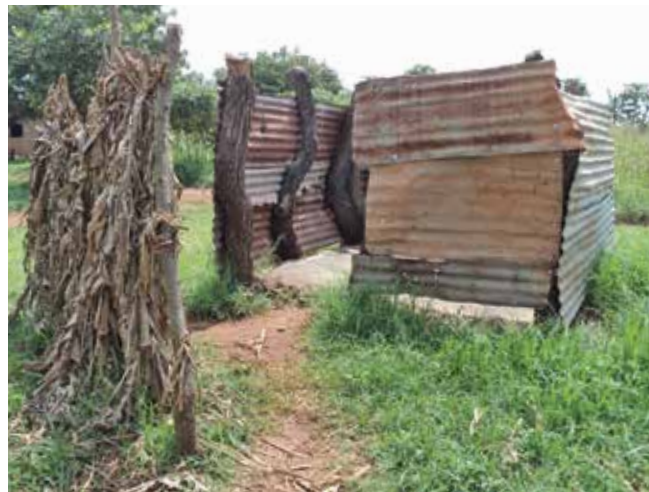
At Olelepek Primary School in Apac District, girl pupils bathe in a make-shift shower with little privacy. The lack of adequate sanitation compromises pupils' human right to health and dignity.

Private schools generally provide better education services and thus have higher retention rates and pass rates in comparison to UPE schools. 17 More worrisome than this general assessment, however, is the even bigger disparity that exists between rural and urban schools. 18 In addition, government has not effectively monitored private education institutions to ensure that they conform to the rules and regulations governing education in Uganda.