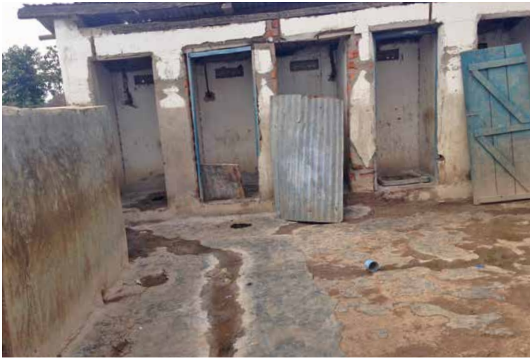
At Abelokweri Primary School in Apac District, inadequate latrines contribute to the spread of water borne and bacterial infections and offer pupils no privacy, which is especially important to girl pupils during menstruation.

In the light of the above, it should come as no surprise that the poor sanitation and hygiene in UPE schools has adversely affected the quality of education provided and partly to blame for the increase of school dropout rates. School dropout rates resulting from poor sanitation disproportionately affects the girl child, and it has been observed that over years many girls enroll in the lower classes but few finish primary seven. One of the reasons attributed to this phenomenon is the poor sanitation and hygiene conditions found in many schools, which do not favour girls, particularly during their menstrual periods. Many girls are, consequently, compelled to stay at home, during which time they miss lessons or exams, which invariably impacts negatively on their academic performance, and in the long run may result in some girls abandoning their studies completely.