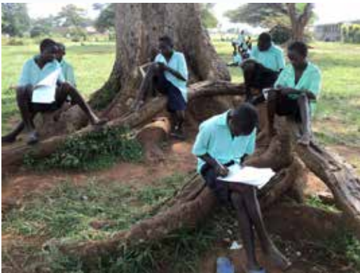
Pupils of Awir Primary School in Apac District writing exams under a tree due to limited classrooms

Question: Some classroom blocks and latrines have remained substandard despite billions being injected into such projects. Who is responsible for the shoddy work?